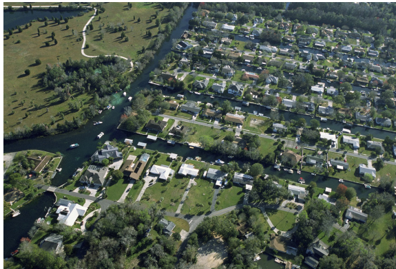
Figure 12.8. Habitat fragmentation.

Fragmented habitats and human land uses will hinder movement of species, further reducing their ability to shift their distributions in response to climate change (Lawler et al. 2009;