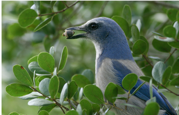
Figure 12.2. Florida scrub jay.

mice, sea turtles, beach nesting birds, and many endemic plant species. Many of Florida's rarest and most diverse communities occur as small isolated areas, such as pine rocklands, rockland hammocks, upland glades, seepage slopes, cutthroat seeps and springs (Knight et al. 2011). Florida has an extremely diverse estuarine and marine ecosystem; it is the only state in the continental U.S. with an extensive shallow reef system. The mild tropical-maritime climate of the Florida Keys provides habitats for a number of terrestrial and marine plant and animal species found nowhere else. The Florida Everglades has received international recognition and has long been recognized as one of our nation's most imperiled landscapes, included as one of 44 sites globally and one of two sites in the United States on the UNESCO List of World Heritage in Danger (Mitchell and Krueger 2011, Aumen et al. 2015). The Everglades is home to 68 threatened and endangered species (USFWS 1999). The Lake Okeechobee ecosystem is unique