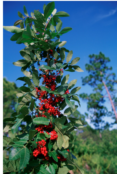
Figure 12.9. Brazilian pepper.

Climate change can lead to the establishment of new invasive species via three mechanisms: removal/reduction of climatic constraints, tolerance of climate leading to persistent populations, and increased competitive ability or rate of spread (Hellman et al. 2008). The competitive resistance of native species may be reduced as climate change causes native species to shift out of the conditions to which they are adapted (Byers 2002). It is expected that, on average, mechanisms (e.g., dispersal) enabling invasion will allow existing invasive species to expand their ranges into newly suitable habitat more quickly than native species. Therefore, those species that have the ability to shift ranges quickly would have a competitive advantage if native populations become progressively poorer competitors for resources in a changing climate (Hellman et al. 2008). For example, some invasive species such as kudzu ( Pueraria lobata ) may benefit when CO 2 concentrations increase or historical fire regimes are disturbed (Dukes and Mooney 1999).