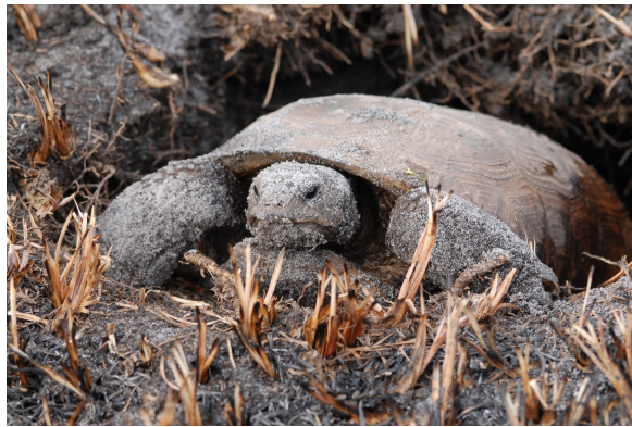
Figure 12.6. Gopher tortoise.

A keystone species is a species that has a significant effect on its environment relative to its abundance and plays a critical role in maintaining the structure of an ecological community, affecting a suite of other species in an ecosystem. Examples of keystone species in Florida include the gopher tortoise, reef building species and the American alligator ( Alligator mississippiensis ). The gopher tortoise is considered a keystone species for the sandhill