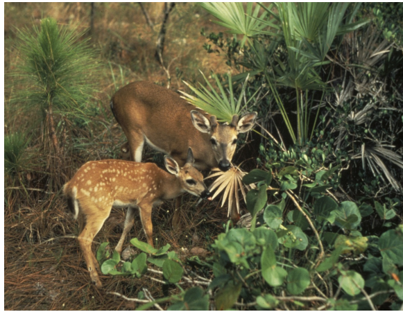
Figure 12.4. Florida Key Deer.

well as loss of crucial coastal habitat for species such as diamondback terrapin ( Malaclemys terrapin rhizophorarum ), which requires both marsh and beach habitats (Shellenbarger Jones et al. 2009). Inundation of coastal habitats will increase fragmentation as patches are divided by areas of open sea water. Sea level rise threatens small and low-lying islands with erosion or inundation (Baker et al. 2006; Church et al. 2006), many of which support high concentrations of rare, threatened, and endemic species (Baker et al. 2006). Of