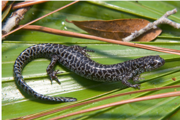
Figure 12.5. Flatwoods salamander.

Herbaceous wetlands provide the foraging and nesting habitat for many species, including waterfowl, Florida sandhill crane ( Grus canadensis pratensis ), snail kite ( Rostrhamus sociabilis plumbeus ), limpkin ( Aramus guarauna ), mink ( Mustella vison ), river otter ( Lutra Canadensis lataxina ), Florida gopher frog ( Rana capito ), tiger salamander ( Ambystoma tigrinum ), and flatwoods salamanders ( Ambystoma cingulatum ). These wetland-dependent