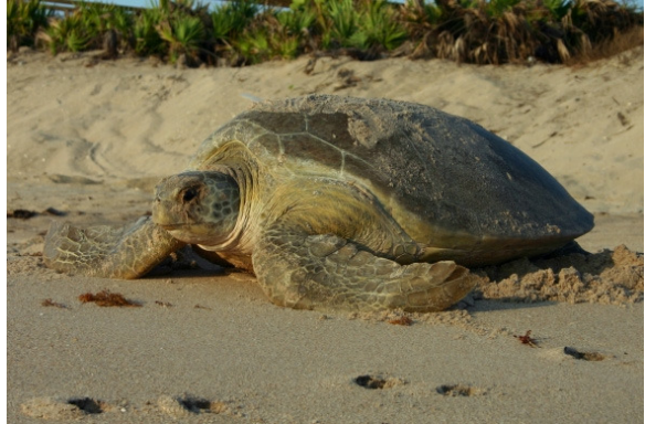
Figure 12.7. Green Sea Turtle.

Sea turtles play important ecological roles in both oceanic and terrestrial habitats (Hawkes et al. 2009). They help maintain sea grass meadows and coral reefs by grazing on sea grass plots and sponges, respectively (Bjorndal 1980), they provide transportation for epibionts, and their egg clutches and dead hatchlings provide nutrients to beach and dune vegetation (Bouchard and Bjorndal 2000; Hannan et al. 2007). Sea turtles also have important cultural, social, and economic significance (Campbell 2002; Campbell and Smith 2006). In Florida for example, residents are willing to pay $42–$57 per year for five years to protect sea turtle habitats from sea level rise (Hamed et al. 2016). As emblematic species, sea